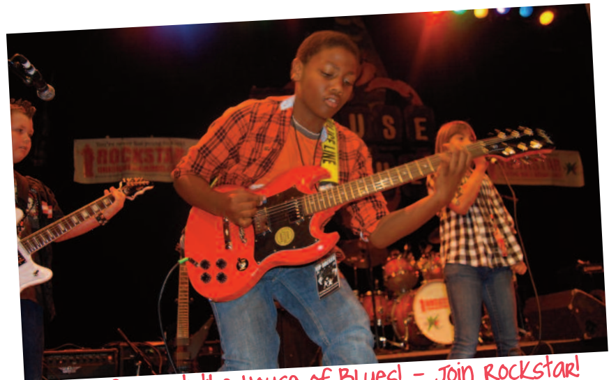
Perform at the House of Blues! - Join Rockstar!

STAR Education is the Largest Provider of Gifted & Talented Instruction in the State!