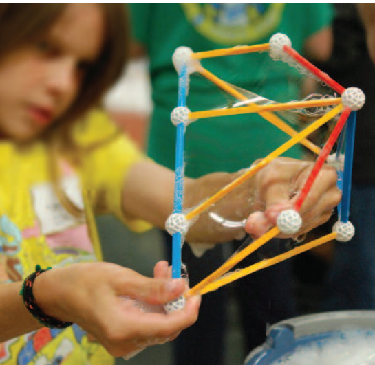
Geometry through Zome TOOL!