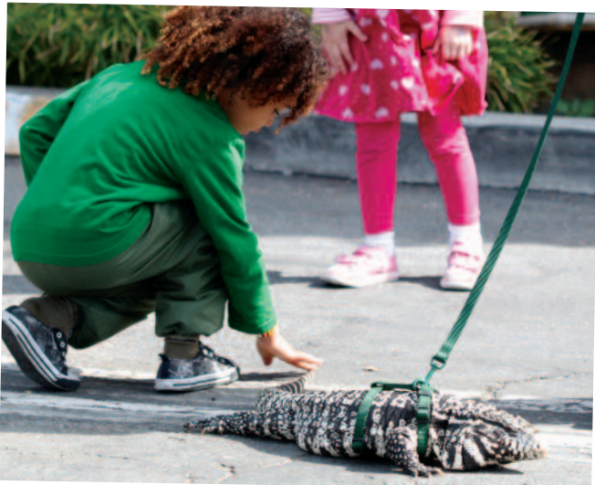
Learn from Real eco station Animal heroes!