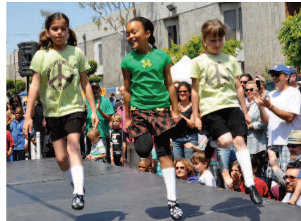
Perform in front of Live audiences!